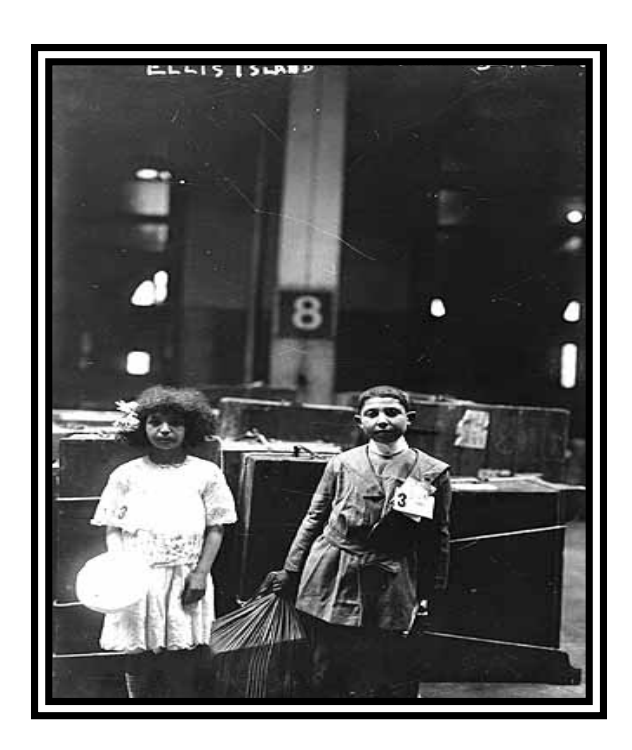
East Coast Immigration