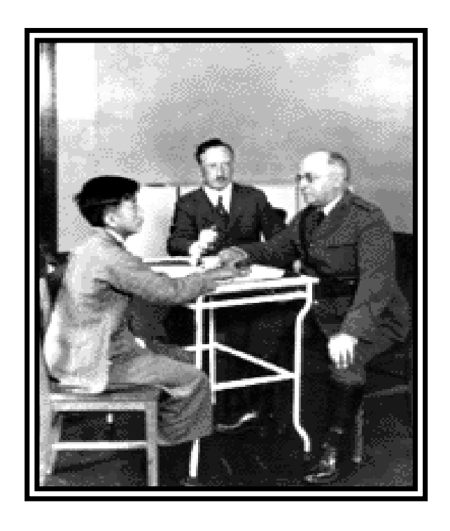
West Coast Immigration